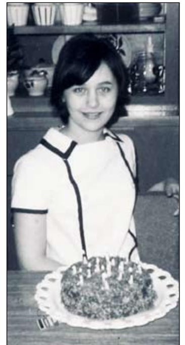
From your husband