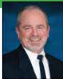
State Senator Phil Murphy